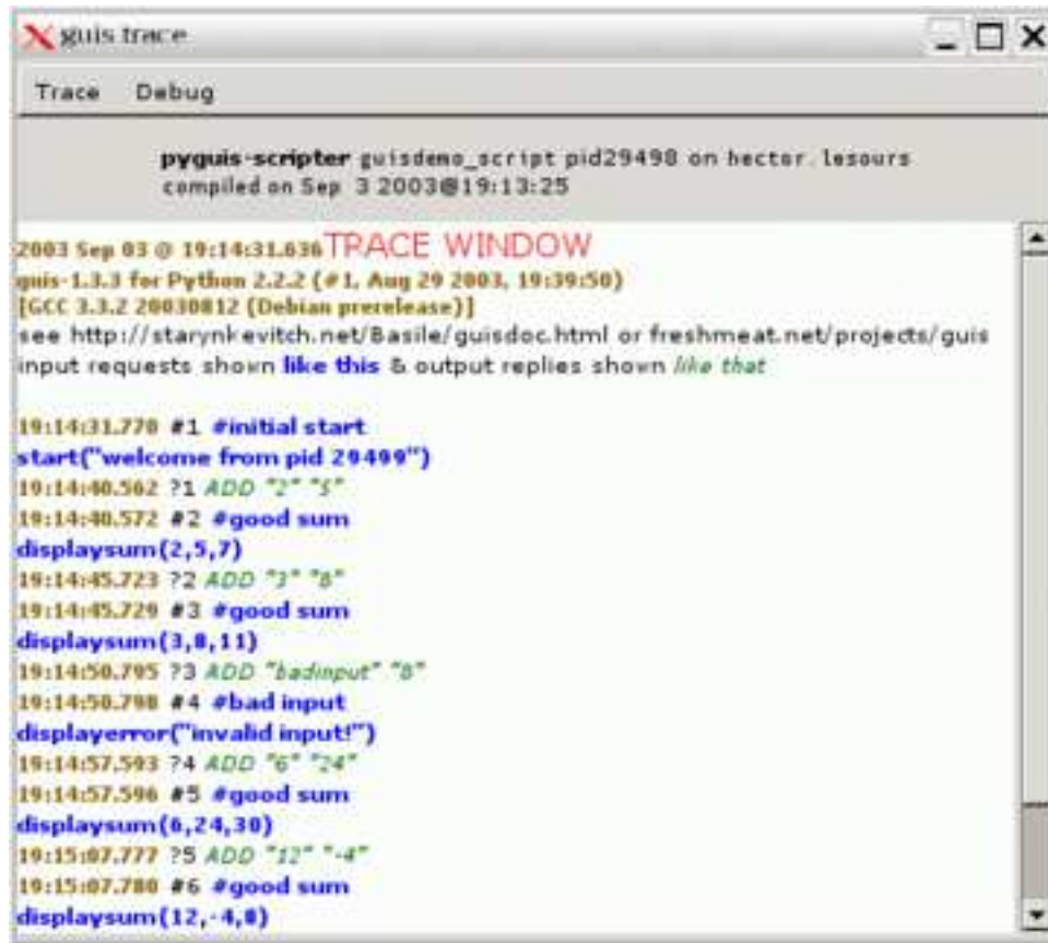
Figure 2: Protocol trace window

When run with the -T flag, Guis opens a window to show the trace of all requests and replies (this is useful for script and application debugging):